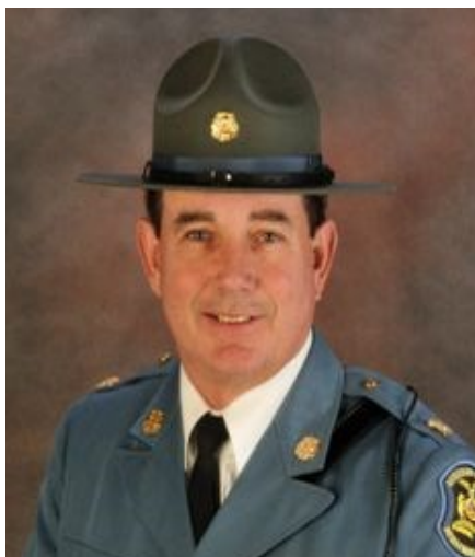
CJIS Systems Officer Major