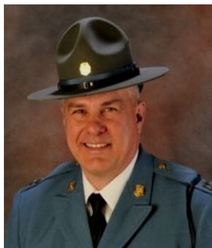
Division Director Captain