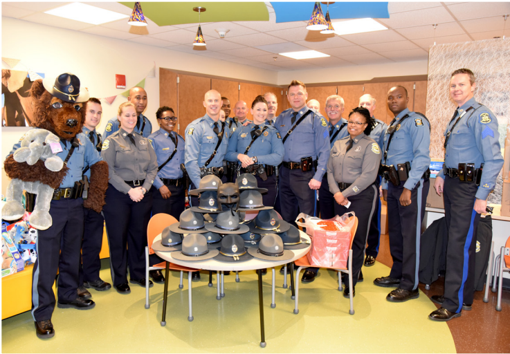
Missouri State Highway Patrol and Kansas Highway Patrol employees pause for a photo before delivering toys.