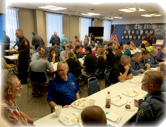
Troop D employees and retirees enjoyed lunch together to mark the Patrol's 85th anniversary.