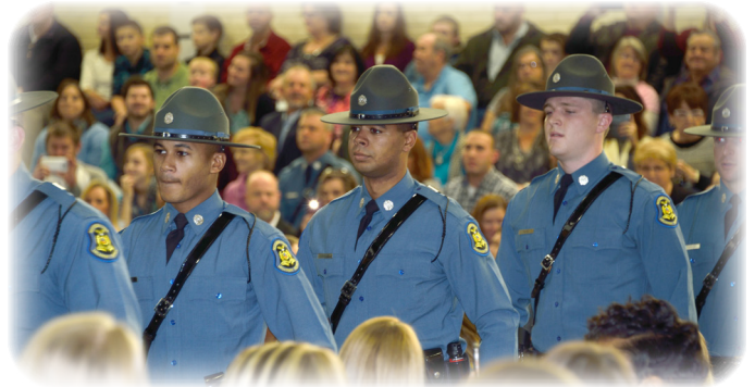
Members of the 103rd Recruit Class file into the gymnasium for graduation.

Governor Jay Nixon provided the keynote address. He congratulated them on their achievement saying the MSHP stands above the rest. "It's more than tactics and technical training; beyond EVOC and the firing range," Gov. Nixon told the class. "You are becoming troopers in a crucial time for law enforcement and