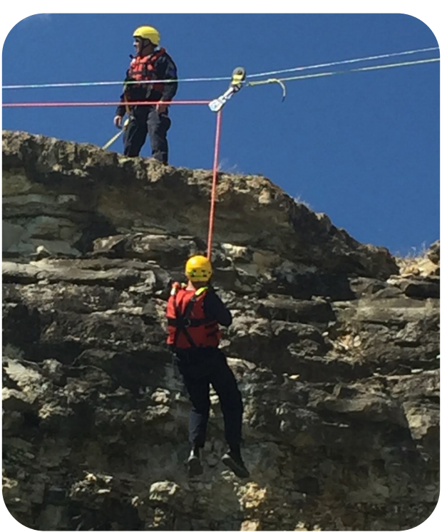
Dive Team members train for a vertical entry into the water. This technique is often used with wells, caves, etc.

encountered the large brush pile, and climbed over it and out into the current of the river. I located the vehicle with my fin and then transferred from the rope to the vehicle, which was upside