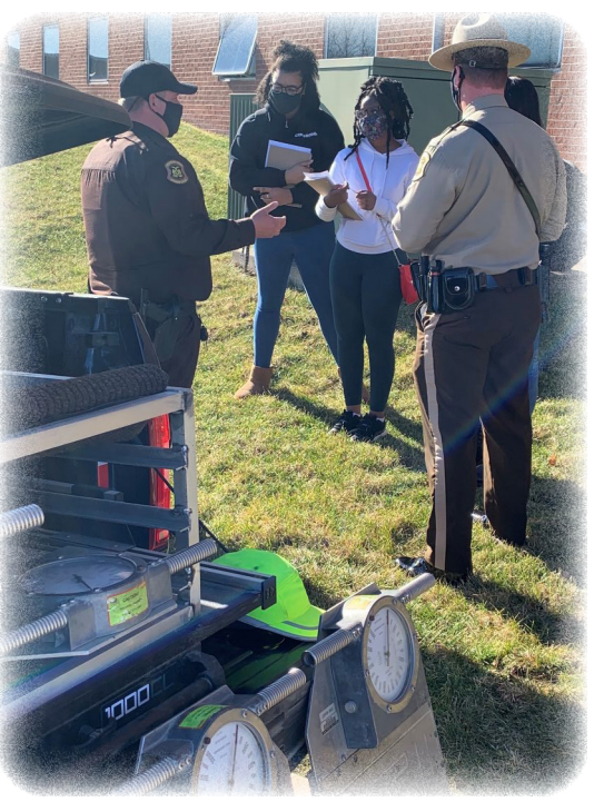
Students were quite interested in the commercial vehicle enforcement display.