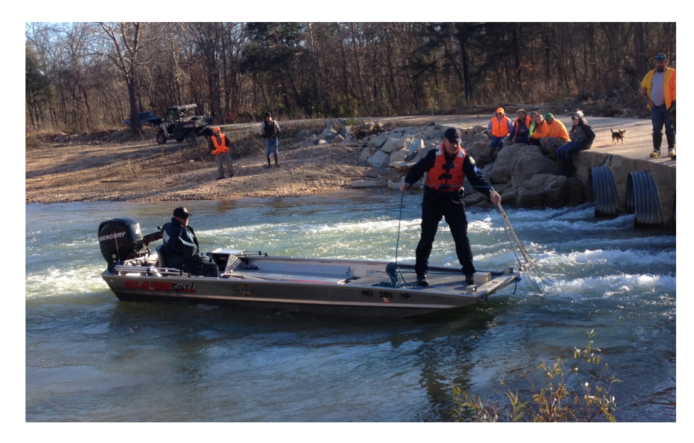
Marine enforcement operations troopers perform a dragging operation in the hole of water where the truck was located.

Marine enforcement troopers searched for a flood victim in Reynolds County, after a driver in a pickup attempted to cross a low water bridge (pictured) in the early morning hours on November 18, 2015. At the time, water was rushing approximately four feet over the top of the bridge. The fast moving water swept the vehicle off the bridge. The troopers approached the pickup by boat and checked for occupants, but found none. The pickup was removed from the water, and the marine enforcement troopers then searched downstream for the next two days. On November 20, 2015, the victim was located in approximately three feet of water 1.5 miles downstream from the low water bridge.