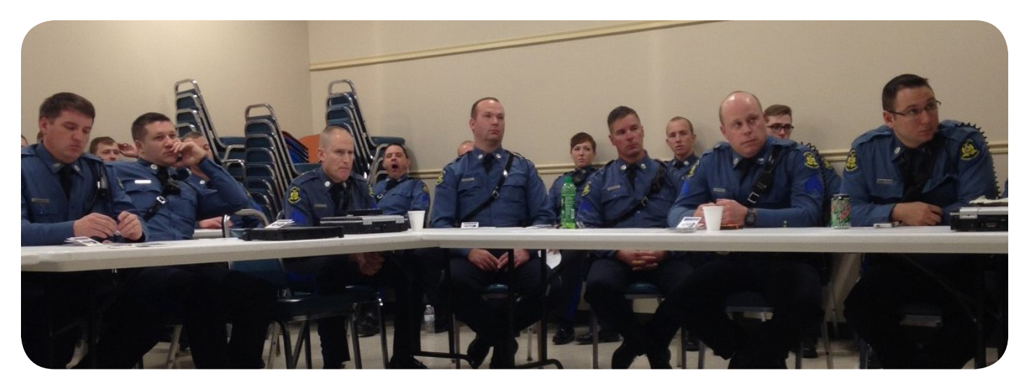
Members of Troop F attend Below 100 training.

Several incidents presented during the program revealed situations that were not only disproportionately