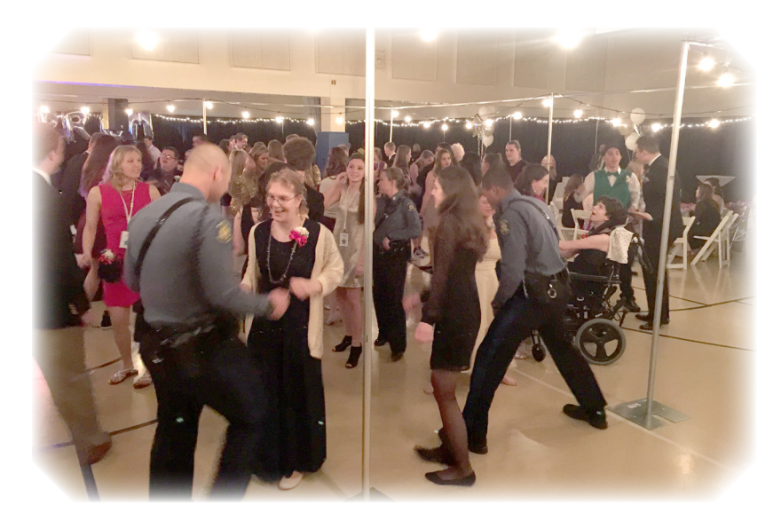
Several troopers represented the agency at the Night to Shine event.