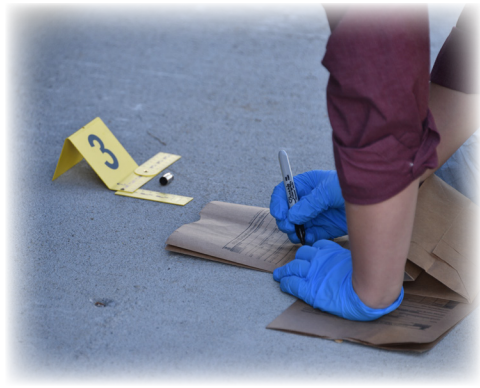
Evidence is processed and packaged during the 2018 Constitution Project.