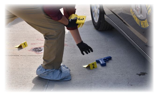
A student investigator marks evidence for photographing and collection.