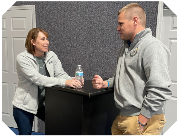
14 Patrol News/November-December 2022

"I've been to lots of seminars and conferences all over the country in the interest of my professional development, and I can honestly say I've never attended anything truly worthwhile as PCIS. I hit what might be termed as my breaking point three years ago after experiencing a lineof-duty death ... What was already a pretty terrible experience was compounded, in retrospect, by the previous 15 years' worth of stressful experiences working in law enforcement, the fire service, and EMS. At the time, nothing like PCIS was available. While peer support was available, I simply didn't know where to turn for it. My three days in Branson (MO) with everyone last week was indeed therapeutic, but also educational. I've had a passion for responder mental health since I