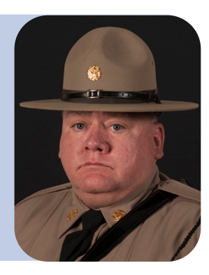
Retired November 1, 2022. 29 years, one month of dedicated service.