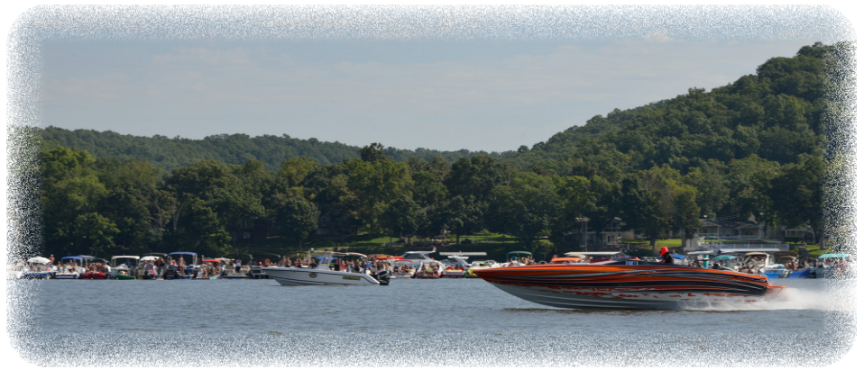
Troopers position themselves between spectator and sport.