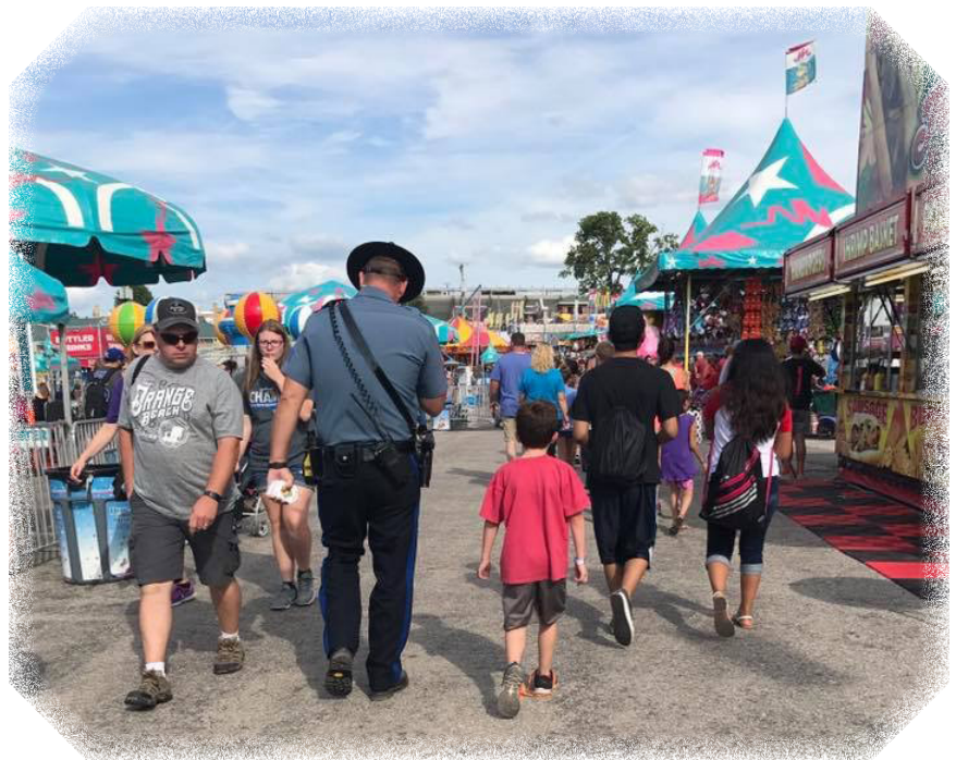
A little boy walks alongside a trooper at the Missouri State Fair.

Hope to see you at next year's Missouri State Fair from August 9-19, 2018!