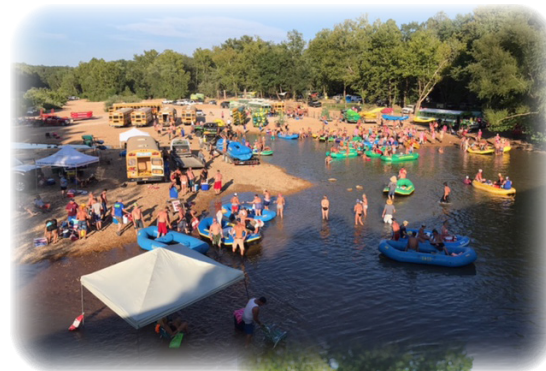
The Ozark Outdoor Campground marks the end of the Bull Float.

Everyone enjoyed the assignment, because it's a change of pace. This type of assignment allows more interaction with the public for general conversation—a lot like the Missouri State Fair. Many kind words and handshakes were observed between troopers and the floaters, and it always feels good to be appreciated. It was clear from my observations and the conversations that I had that the appreciation flows both ways. We are already looking forward to Bull Float 2018!