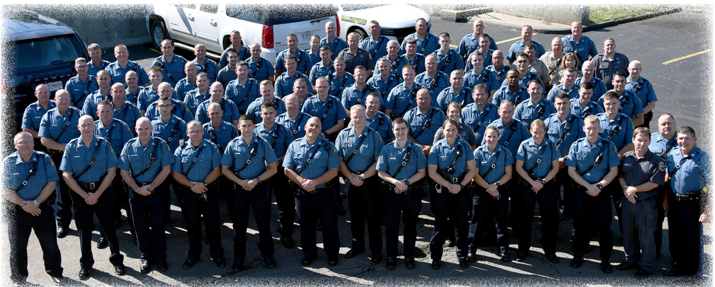
Congratulations to the 2019 Missouri State Fair detail on a job well done!