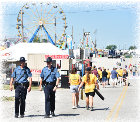
Troopers keep watch over every aspect of the state fair.