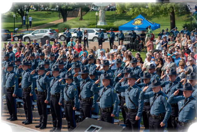
Members of the 111th Recruit Class salute during the singing of the National Anthem.