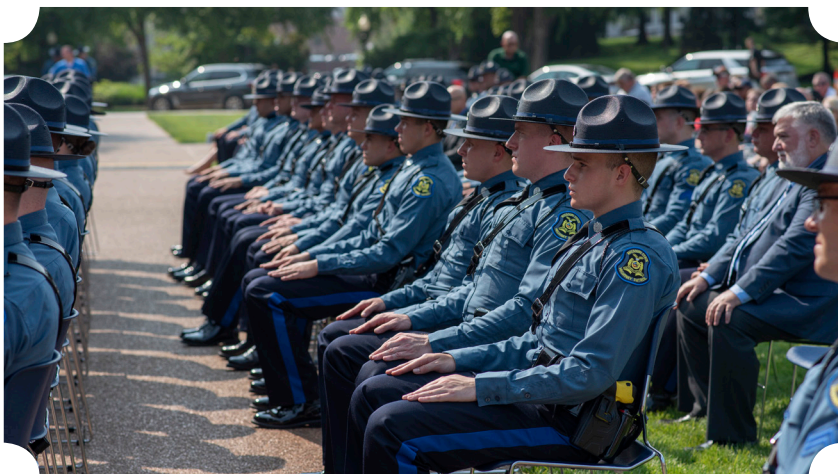
The 111th Recruit Class is seated and ready to graduate!